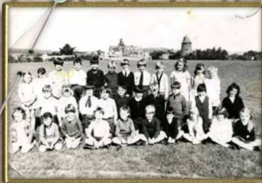
Windmill School class 1973