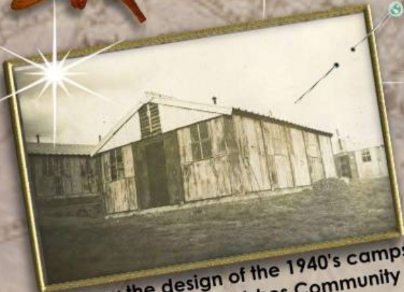
Notice how the design of the 1940's camps on Burlish are similar to the Walshes Community Centre

We moved to our brand new house on Linden Avenue in 1952