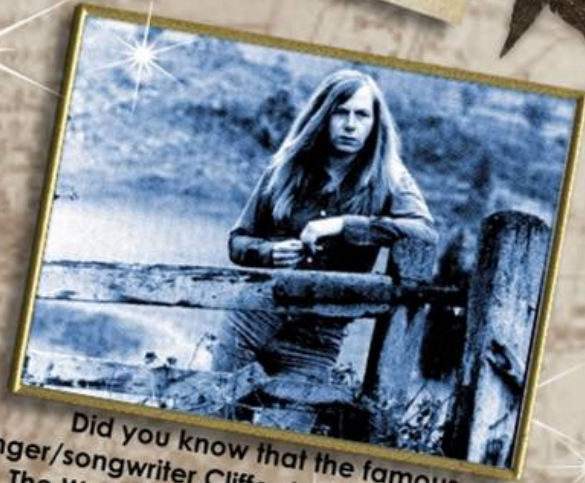
Did you know that the famous singer/songwriter Clifford T Ward grew up on The Walshes, he lived in Erneley Close

"I remember moving into our brand new house on Wesley Avenue in June 1964.